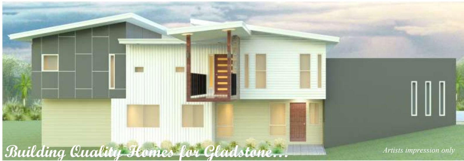
Artists impression only